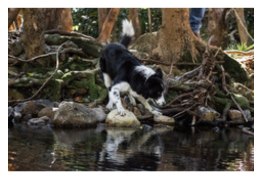
This conservation detection dog can sniff out the scent of different species on land and in water.

MELBOURNE , Australia (Achieve3000, December 4, 2019). What can't a dog sniff out? Police K-9s detect everything from missing persons to fake money. Healthcare pup-fessionals can pick up the scent markers of certain early-stage cancers and foods that make people sick.