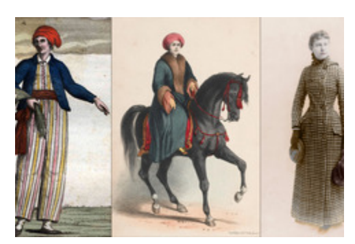
Photo credit: Left to right: Cristoforo Dall'Acqua, Wellcome Collection, Library of Congress Left to right: Jeanne Baret, who was the first woman to sail around the globe. Lady Hester Stanhope, who led an archaeological dig in the Middle East. And Nellie Bly, a respected journalist who traveled around the world in just 72 days.

RED BANK, New Jersey (Achieve3000, January 31, 2020). Nowadays, women sail solo around the world, bicycle across continents, and travel into space. But this kind of female groundbreaking adventure was almost unheard of centuries ago, when women were expected to stay at home and raise families. That, however, didn't stop some women from taking off and blazing trails.