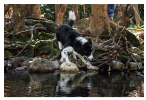
This dog can sniff out the scent of different animals on land and in water.

MELBOURNE , Australia (Achieve3000, December 4, 2019). Dogs can sniff things out. They have a super sense of smell. It's 10,000 to 100,000 times stronger than a person's!