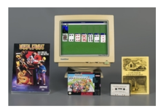
Each year, games are chosen for the World Video Game Hall of Fame.

ROCHESTER, New York (Achieve3000, May 10, 2019). Super Mario Kart. Microsoft Solitaire. Colossal Cave Adventure. What do these games have in common? In 2019, they were chosen for the World Video Game Hall of Fame.