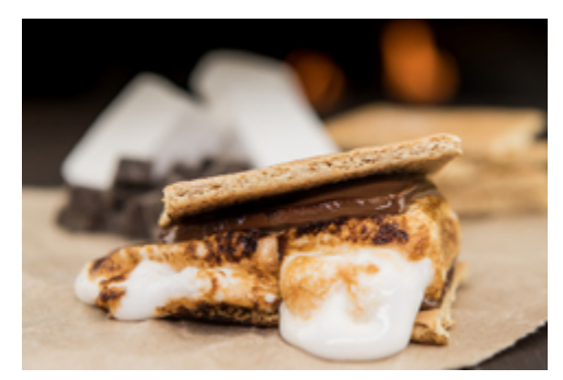
This is a s'more. It's made of chocolate, marshmallows, and graham crackers.

SAVANNAH, Georgia (Achieve3000, July 18, 2019). S'mores are yummy. Want to make some? Here's how: