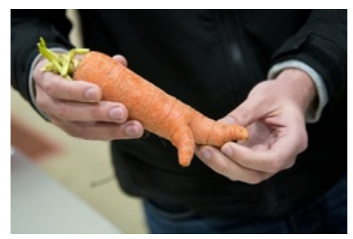
Does this carrot have a tail? A company is selling it anyway.

URBANDALE, Iowa (Achieve3000, May 6, 2019). Would you buy ugly produce? Many people wouldn't. So supermarkets don't sell it.