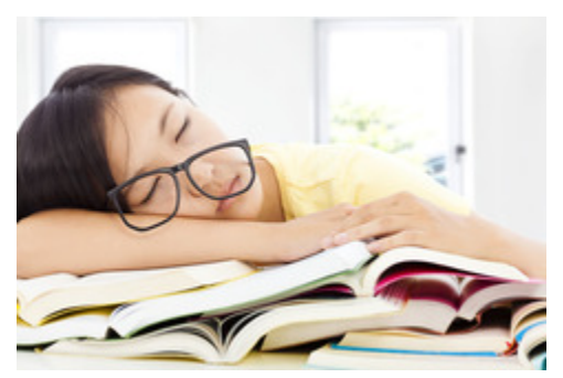
Too tired to learn? Some people think schools should start later.

SACRAMENTO, California (Achieve3000, October 30, 2019). Like to snooze? Here's good news! Some schools are starting later.