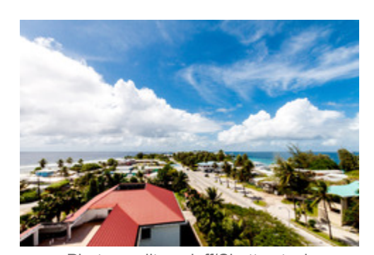
This is the city of Majuro. It's in the Marshall Islands, a Pacific Island nation.

MAJURO , Marshall Islands (Achieve 3000, November 7, 2019). There are 11 countries in the Pacific Islands. But they all have one big problem. What is it? Climate change.