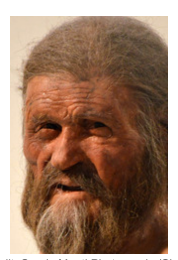
This is what Ötzi the Iceman may have looked like.

BOLZANO, Italy (Achieve3000, November 21, 2019). It was about 5,300 years ago. A man was climbing up a mountain in Italy. He was hurt. And it was cold. Would he stay alive? He would not. But today, people are learning all about him. Here's why.