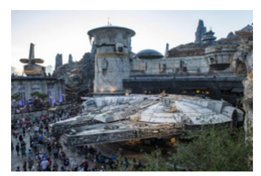
This starship can be found at Disney's Star Wars: Galaxy's Edge.

ORLANDO, Florida (Achieve3000, September 26, 2019). It's a Star Wars fan's dream! In 2019, Disney opened Star Wars: Galaxy's Edge. It's a new land. People who go feel like they're in a Star Wars story.