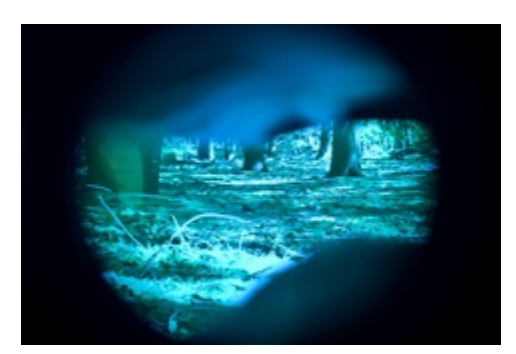
People at the exhibition can learn how dogs see.

LOS ANGELES, California (Achieve3000, May 5, 2019). Why do dogs smell things? Why do people and dogs get along so well?