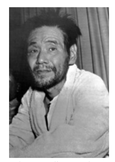
This photo of Shoichi Yokoi was taken shortly after his return to civilization in 1972.

TALOFOFO, Guam (Achieve3000, August 27, 2019). When Shoichi Yokoi went into hiding in the jungles of Guam in 1944, little did he know that he would one day emerge a changed man in a changed world. His stay there is one of the strangest footnotes in the history of World War II and a tale of astonishing loyalty.