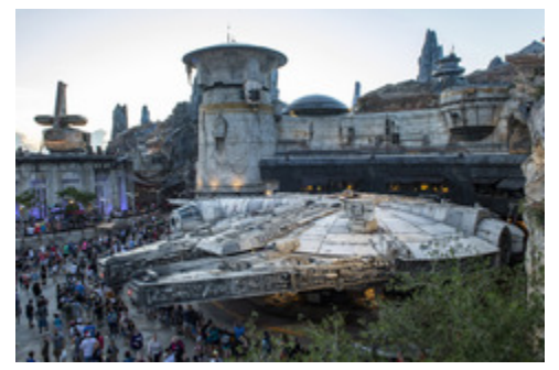
A full-size replica of the famous Millennium Falcon starship is just one of the attractions at Disney's Star Wars: Galaxy's Edge.

ORLANDO, Florida (Achieve3000, September 26, 2019). Disney parks may be "the happiest" and "most magical" places on Earth, but they have some lands that are out of this world—in a galaxy far, far away! And unlike other parks where cast members are on the same team, at Star Wars: Galaxy's Edge, you've gotta choose your alliances.