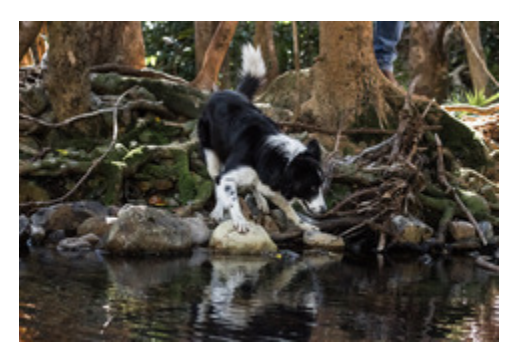
This conservation detection dog can sniff out the scent of different species on land and in water.

MELBOURNE, Australia (Achieve3000, December 4, 2019). What can't a dog sniff out once it puts its snout to the task? Police K-9s detect everything from missing persons to counterfeit money. Healthcare pup-fessionals can pick up the scent markers of certain early-stage cancers, dangerous allergens in foods, and sudden changes in human blood-sugar levels. And let's not forget an ordinary dog's amazing ability to smell a just-opened can of dog food from afar.