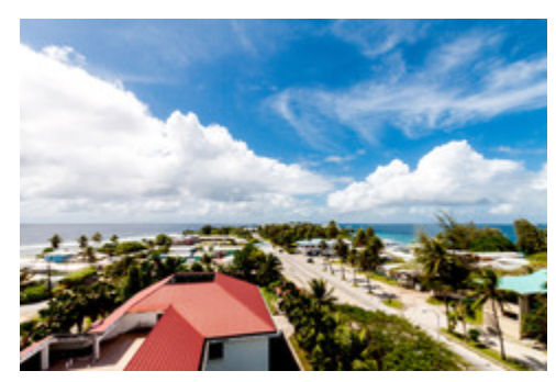
The capital city of Majuro, Marshall Islands, is only 300 feet wide in most places, yet the thin strip of land is home to over 27,000 people.

MAJURO, Marshall Islands (Achieve3000, November 7, 2019). Living on a tropical island might sound fabulous, but what if you took a trip or went away for college and found you could never return? What if your home, and even the land it stood on, was gone forever? This isn't the plot of a fantasy movie or the premise of a video game—it's a painfully real possibility faced by people living in the Pacific Islands. Rising sea levels, due to the advent of climate change, threaten the very existence of these island nations. And young people whose families have deep roots on the islands are starting to wonder if they will be the last generation.