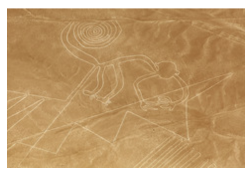
This is an aerial view of a monkey geoglyph, one of the many ground drawings in southern Peru known as the Nazca Lines.

NAZCA, Peru (Achieve3000, January 3, 2020). One quality common to the greatest wonders of the ancient world is their magnificent conspicuousness. It's impossible to walk past the pyramids in Egypt and Mexico, for example, or Stonehenge in Great Britain without noticing them—they're right in your face, commanding your attention. And then there are the Nazca Lines in southern Peru.