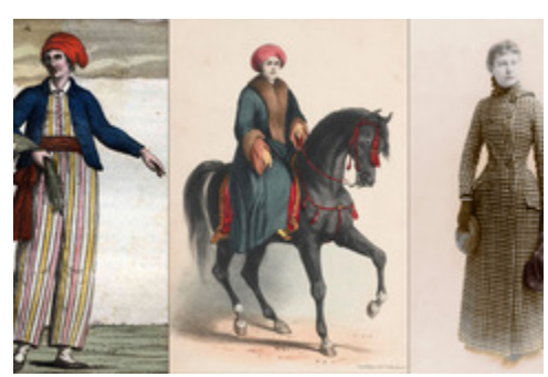
Photo credit: Left to right: Cristoforo Dall'Acqua, Wellcome Collection, Library of Congress Left to right: Jeanne Baret, who was the first woman to sail around the globe. Lady Hester Stanhope, who led an archaeological dig in the Middle East. And Nellie Bly, a respected journalist who traveled around the world in just 72 days.

RED BANK, New Jersey (Achieve3000, January 31, 2020). Nowadays, women sail solo around the world, bicycle across continents, and travel into space in search of adventure. But this kind of female moxie was virtually unheard of centuries ago, when women were expected to stay at home and raise families. That, however, didn't stop some women from taking off and blazing trails.