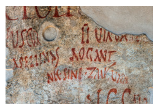
This is one of the more than 11,000 ancient graffiti samples that have been uncovered in the excavations of Pompeii.

POMPEII, Italy (Achieve3000, January 28, 2020). What does a 21st-century social media user have in common with a 1st-century resident of the ancient Roman city of Pompeii? They both posted messages on walls. There is a slight difference, though. Fans of Facebook and other social media sites post their comments on cyber walls. Ancient Pompeians posted theirs on actual ones (the kind that form houses and hold up roofs). Remarkably, some of their original messages are still there 2,000 years later. And so are many of the walls themselves.