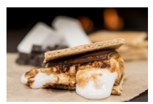
This melty combination of chocolate, marshmallows, and graham crackers is a s'more.

SAVANNAH, Georgia (Achieve3000, July 18, 2019). S'more, j'adore! Roughly translated from French, that means, "I love a s'more." And who among us has not become instantly enamored with the popular campfire treat the minute it melted in our mouths for the very first time?